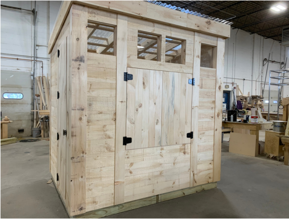
6 ft deep x 8 ft wide

The team designed a set of modular wooden market stalls with flexibility, utility and safety in mind. All materials and fabrications are locally sourced and produced to invest back into the local economy.