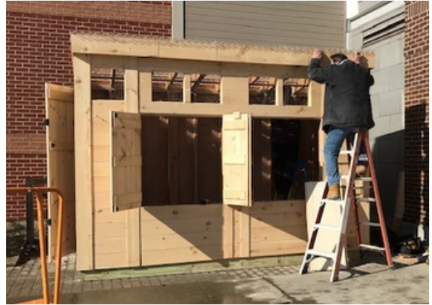
6 ft deep x 12 ft wide

Each market stall includes interior shelving for storing products, exterior racks for hanging product baskets, a counter opening for selling and customer shopping, and a banner display area.